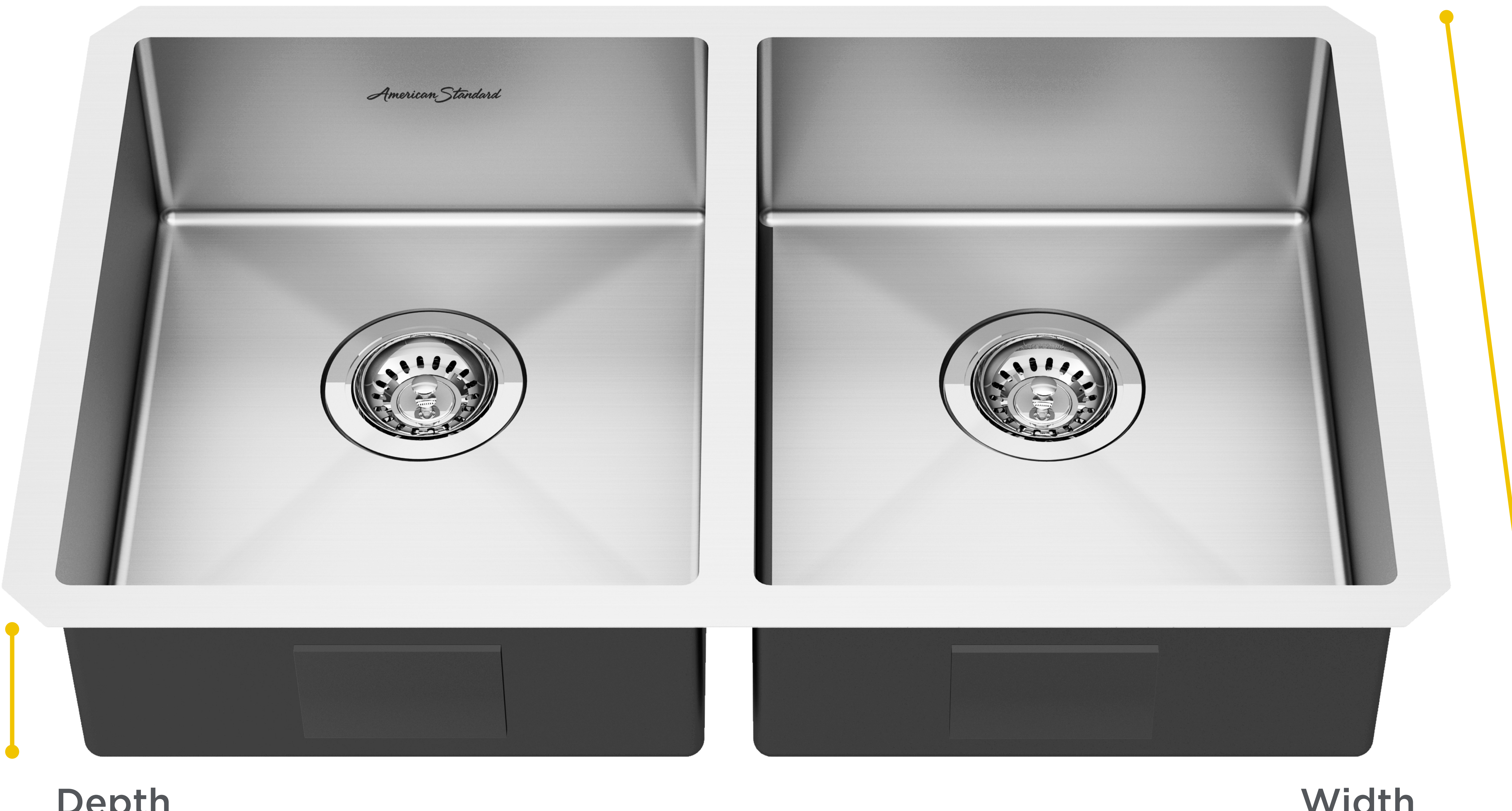
Depth 6" (152 mm)