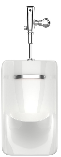
6516 Top Spud

When installed so top of rim is 432mm (17") MAXIMUM from finished floor.