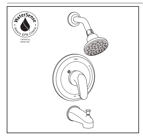
T075.508 Bath/Shower Trim Shown