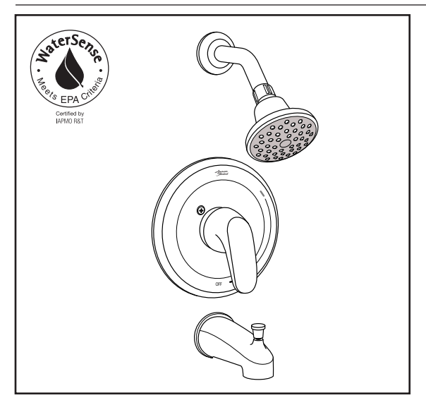
T075.508 Bath/Shower Trim Shown