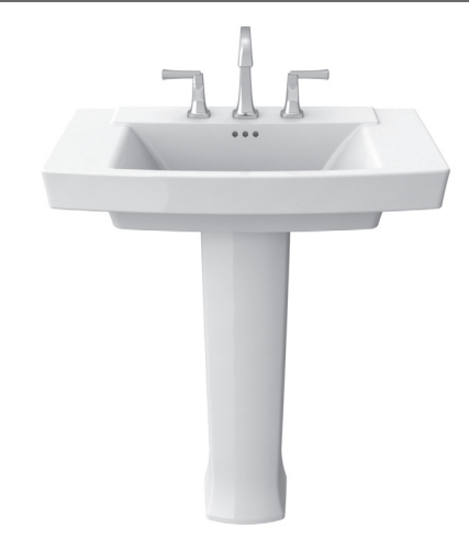
Townsend pedestal combination 0328.800