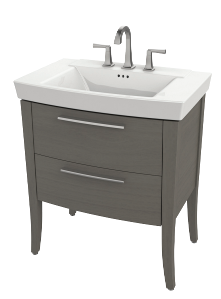
Townsend pedestal top sink 0328.008 shown with 9036.030 vanity and 7760.000 drawer pulls

☐ 7720.018 Optional decorative p-trap drain