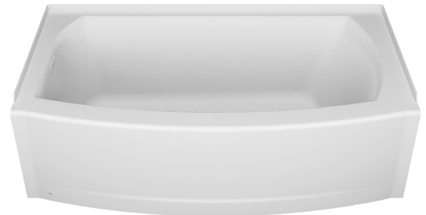
2576212S.011 Ovation Curve 60" x 30" Tub Left Hand Drain