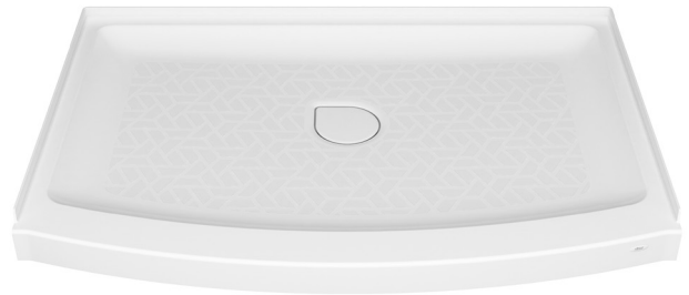
B8015A-ST3.011 SHOWER BASE Center Drain

SEE NEXT PAGE FOR ROUGHING-IN DIMENSIONS AND PRODUCT SPECIFICATIONS