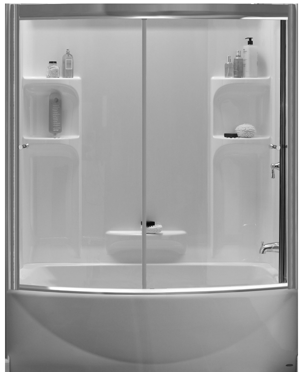
Ovation tub with Ovation wall set and Ovation curved bath door shown.

For color/finish availability and other faucet choices, please see the Product Selector and Pricing Guide.