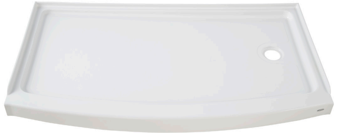
Ovation curved shower base shown.

SEE NEXT PAGE FOR ROUGHING-IN DIMENSIONS AND PRODUCT SPECIFICATIONS