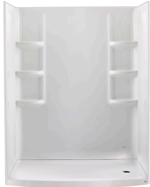
Ovation curved shower base with Ovation wall set shown.

For color/finish availability and other faucet choices, please see the Product Selector and Pricing Guide.