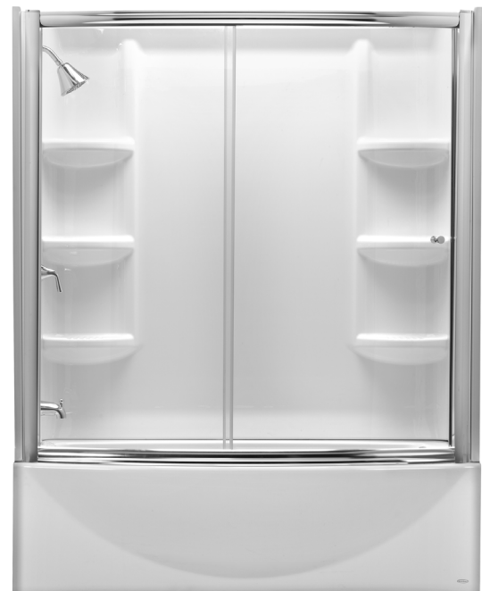
Saver tub with Saver wall set and Saver curved shower door shown.

For color/finish availability and other faucet choices, please see the Product Selector and Pricing Guide.