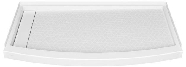
A8014T-LHO.011 Elevate 60" x 30" Curved Shower Base Left Hand Drain