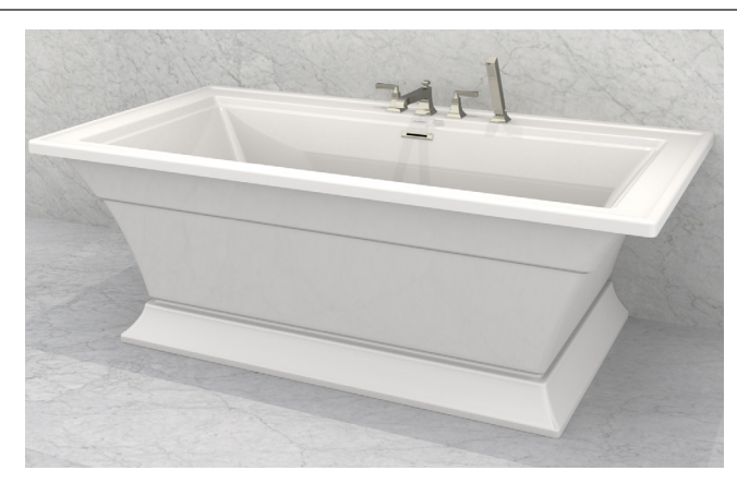
*Deck mount filler and overflow cover sold separately.

SEE REVERSE SIDE FOR ROUGHING-IN DIMENSIONS AND PRODUCT SPECIFICATIONS