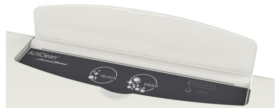
SELF-CLEANING TANK TOP DEVICE

SEE REVERSE FOR ADDITIONAL ROUGHING-IN DIMENSIONS