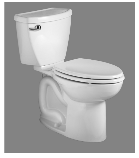
SEE REVERSE FOR ADDITIONAL ROUGHING-IN DIMENSIONS