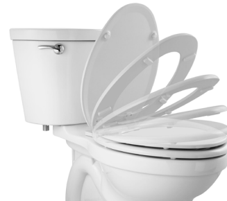
SHOWN: SLOW CLOSE FEATURE