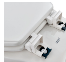
2. Pull the seat