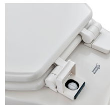
1. Open the hinge cover