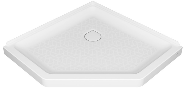
A8017T-CO SHOWER BASE Center Drain