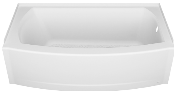
2576102.011 Elevate 60" x 30" Curved Tub Right Hand Drain