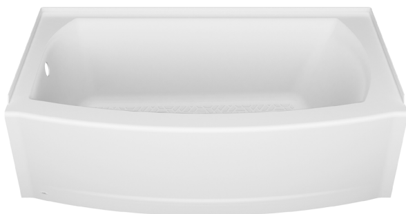
2576202.011 Elevate 60" x 30" Curved Tub Left Hand Drain