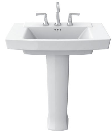
Townsend pedestal combination 0328.800