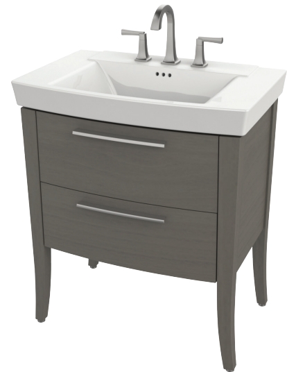
Townsend pedestal top sink 0328.008 shown with 9036.030 vanity and 7760.000 drawer pulls