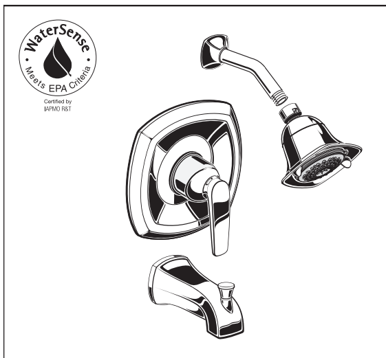
T005.508 Bath/Shower Trim Shown