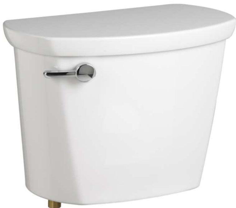
4188A and 4188B series Cadet® PRO Tanks

Vitreous Sanitary Ceramic Ware Tanks with EverClean