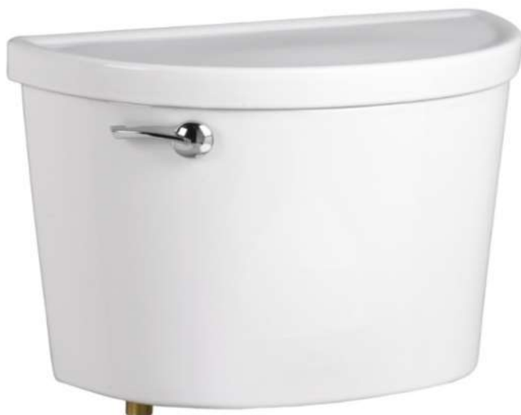
4225 Series of 12" Rough Tanks

Vitreous Sanitary Ceramic Ware Tanks with EverClean ®