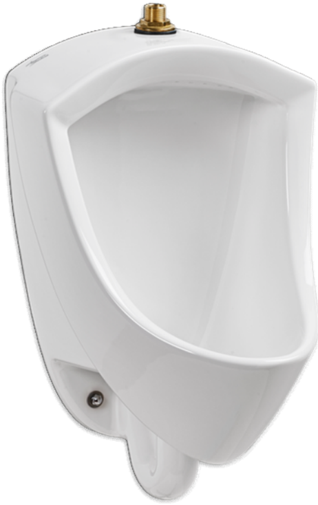
Pintbrook® 6002 series urinal

Vitreous Sanitary Ceramic Ware Flushometer Urinal