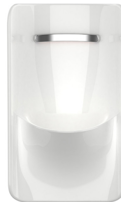
6517001EC Back Spud