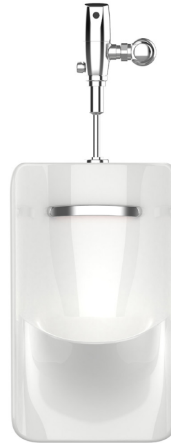
6516 Top Spud